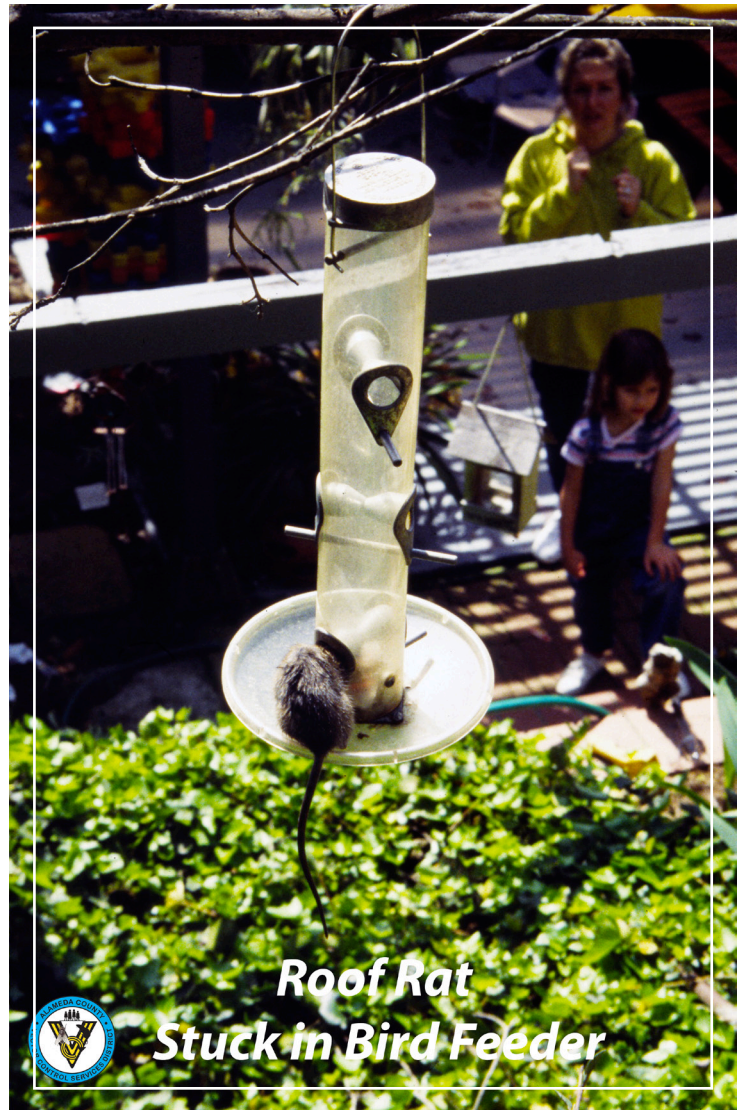
Roof Rat Stuck in Bird Feeder